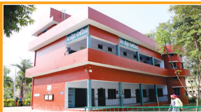
PG DEPARTMENT OF PUNJABI