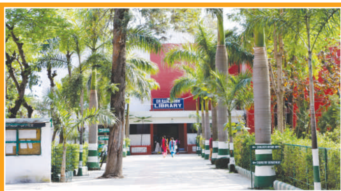
DR. RAM SINGH LIBRARY