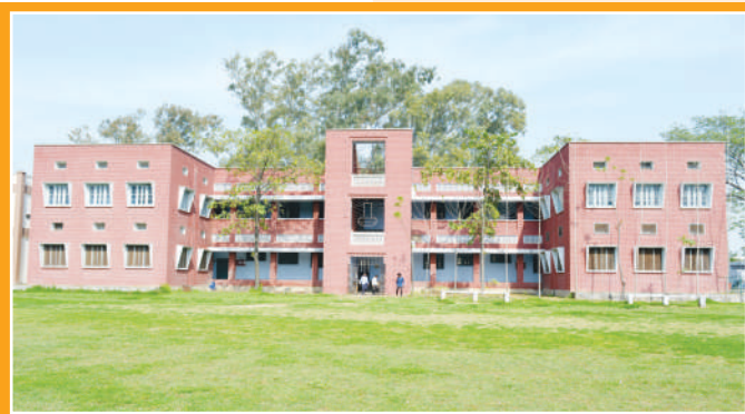
PHYSICS & COMMERCE BLOCK