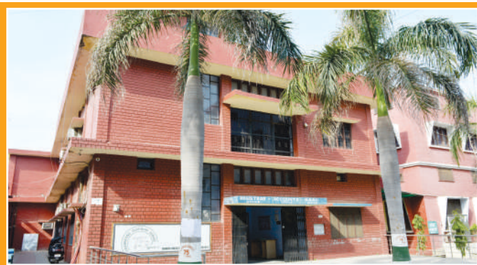
REGISTRAR, ACCOUNTS & NAAC OFFICE