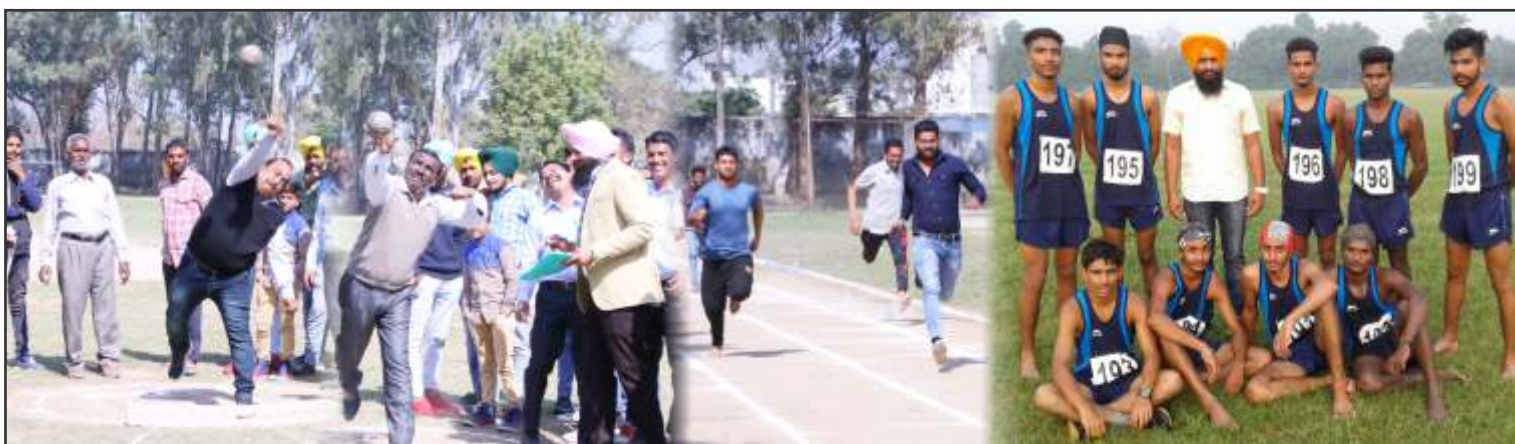
Non Teaching Staff of the BUCC displaying their Athletic Talent by participating in Shotput & 100m Race