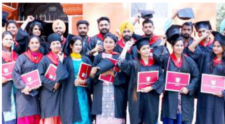
Students are in Jubliant mood after receiving their degrees in College Convocation.